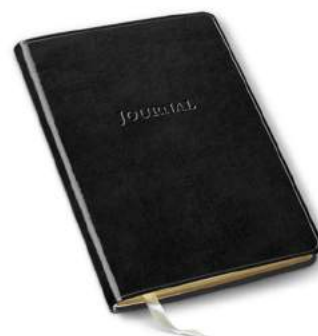
HARD COVER JOURNALS