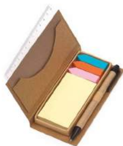
POST IT PADS